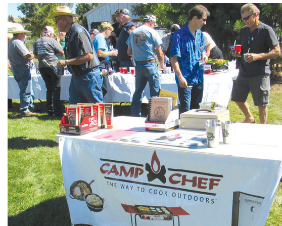
Good food and great fun enjoyed by everyone.