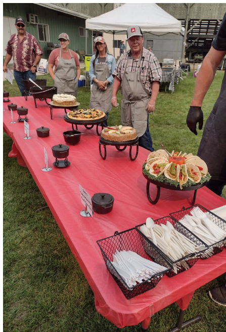
2022 Cook-Off Teams presenting their special dishes to be judged.

A panel of celebrity judges will use International Dutch Oven Society (IDOS) guidelines to determine the Hells Canyon Mule Days Dutch Oven Cook-Off winners. There will be first and second place awards of $100.00 and $75.00 in both the Adult and Youth category, along with a special gift for the People's Choice winner. The People's Choice packet entitles samples of each team's dishes, and to cast a vote for the best dish in each category. People's Choice packets are limited and may be purchased